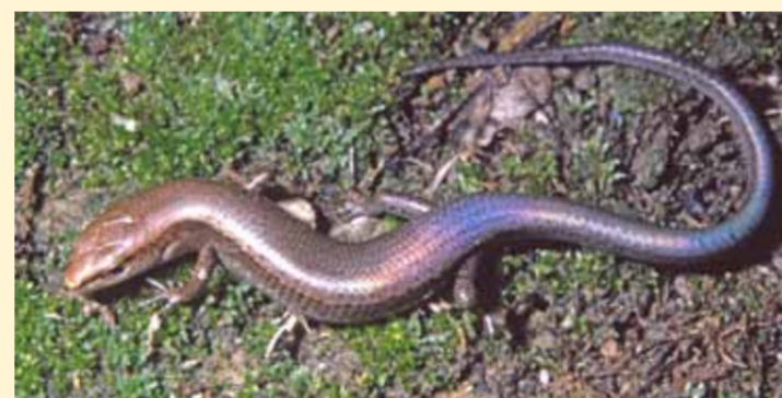
Rainbow skink

Yes, pests can and have hitched a ride on or in bags, clothing and boats.