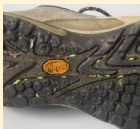
Weeds seeds and soil

Rats can squeeze through a 12mm gap, and mice through a 7mm gap! Mice, insect pests and the invasive rainbow skink could hide in your bag. Weed seeds cling to clothing and shoes. Soil on shoes or gear may carry unwanted plant diseases.