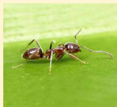
Argentine ant